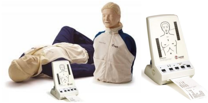
Image 2. Laerdal Resusci Anne SkillReporter CPR Manikin and SkillReporter Device

was applied and all students were required to perform ten sets of CPR (1 set= 30 chest compressions, 2 breaths). The 2010 European Resuscitation Guidelines include recommendations to change rescuers about every 2 minutes to prevent adverse effects of rescuer fatigue and maintain chest compression quality during CPR (Nolan et al., 2010). The required ten sets of CPR were chosen according to the above theoretical framework. A Laerdal Resusci Anne SkillReporter® manikin was used in order to collect pre-test data on nine ventilation and 11 compression skills, which were described in the “Research Design” section. Although the manikin had real-time feedback and debriefing features, it was only used to record data (Image 2).