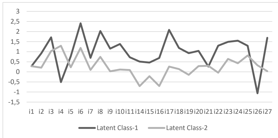
Figure 2. Threshold values of the items by latent classes

As can be seen in Figure 1, there is no important distinction in any country or class by gender, and the numbers according to gender are similar. However, the majority of the first latent class consisted of students participating in the application from Singapore, while the second latent class was composed of students from Kuwait and Turkey. The threshold values of the items according to the latent classes are presented in Figure 2.